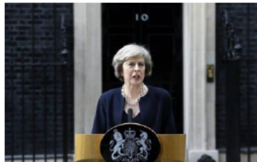
Theresa May Prime Minister

“Brexit means Brexit. We must be clear that we are going to make a success of it - that means no second referendum, no attempts to sort of stay in the EU by the back door.”